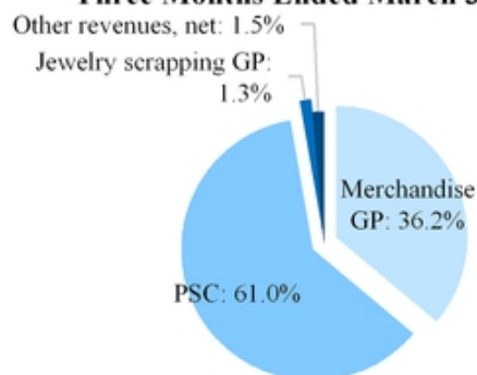
Three Months Ended March 31, 2017